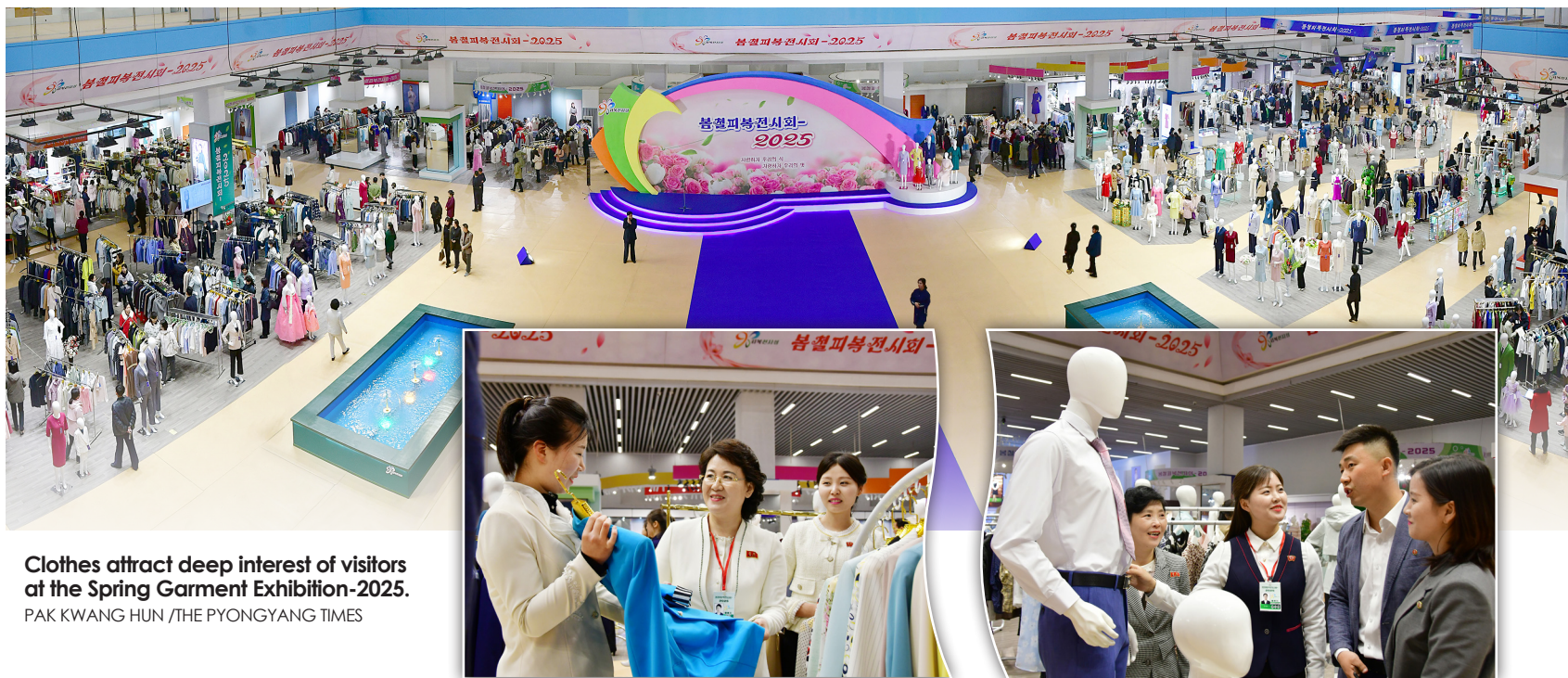
Clothes attract deep interest of visitors at the Spring Garment Exhibition-2025.