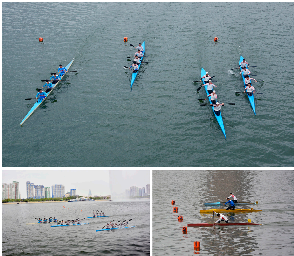
The 2025 Kalmaegi Cup canoeing competition takes place on the Taedong River in Pyongyang amid great interest of experts and fans.