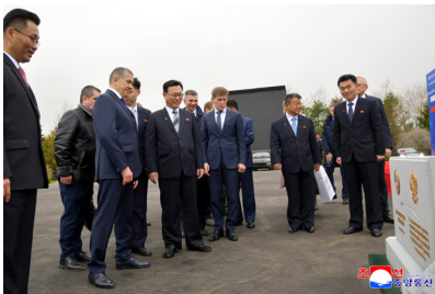
A ground-breaking ceremony takes place simultaneously in Rason Municipality, a border city of the DPRK, and Khasan, a border city of the Russian Federation, on April 30 for the construction of a motor bridge linking the DPRK and Russian borders.