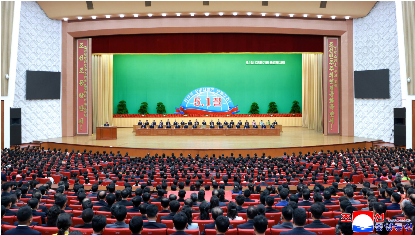
A national meeting is held at the People's Palace of Culture in Pyongyang on May 1 to mark the 135th May Day, the international holiday of the working people across the world.

A national meeting was held at the People's Palace of Culture in Pyongyang on May 1 to mark the 135th May Day, the international holiday of the working people of the whole world. Present there were Pak Thae Song, member of the Presidium of the Political Bureau of the Central Committee of the Workers' Party of Korea and premier of the DPRK Cabinet, Kim Tok Hun, secretary of the Central Committee of the WPK, and other senior Party and government officials, officials of ministries, national agencies, institutions and industrial establishments and working people in Pyongyang. Present there at invitation were members of foreign diplomatic missions in Pyongyang and overseas Koreans staying there. Premier Pak Thae Song