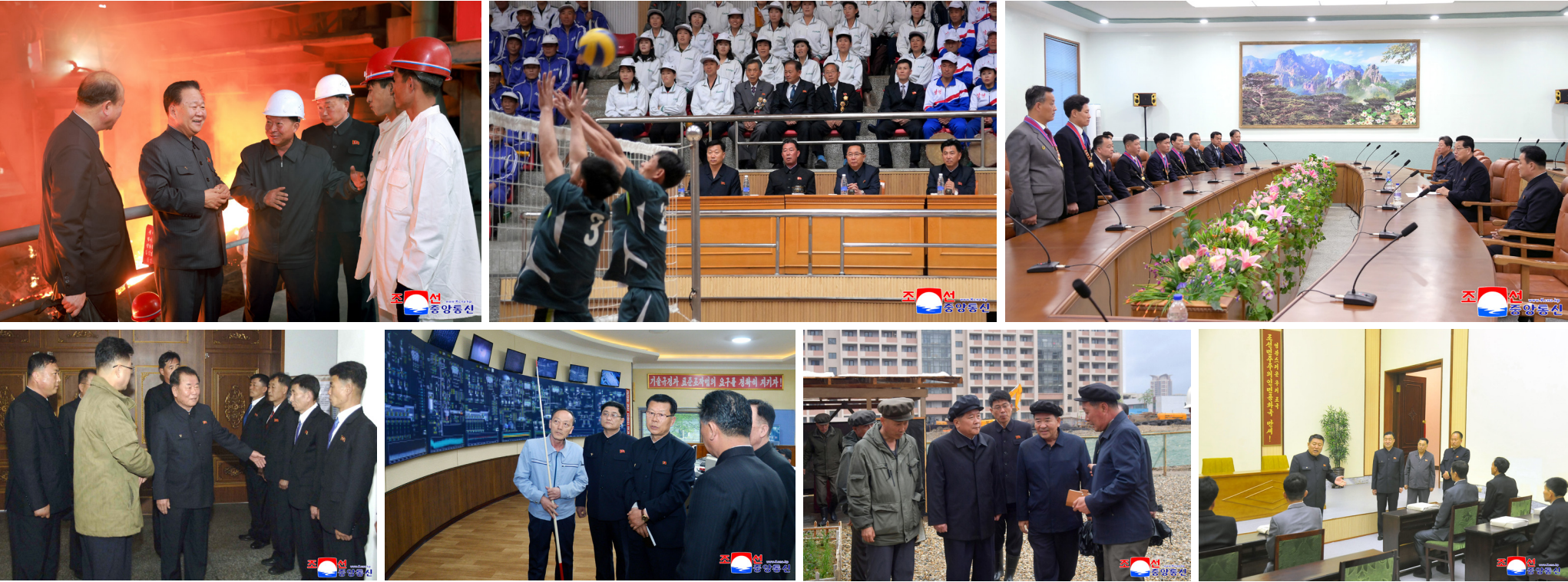
Senior officials of the Party and government visit industrial establishments across the country on May Day to congratulate working people on their holiday.