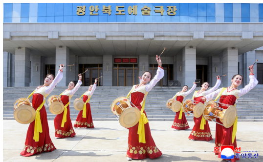
Working people across the country have a good time on May Day.