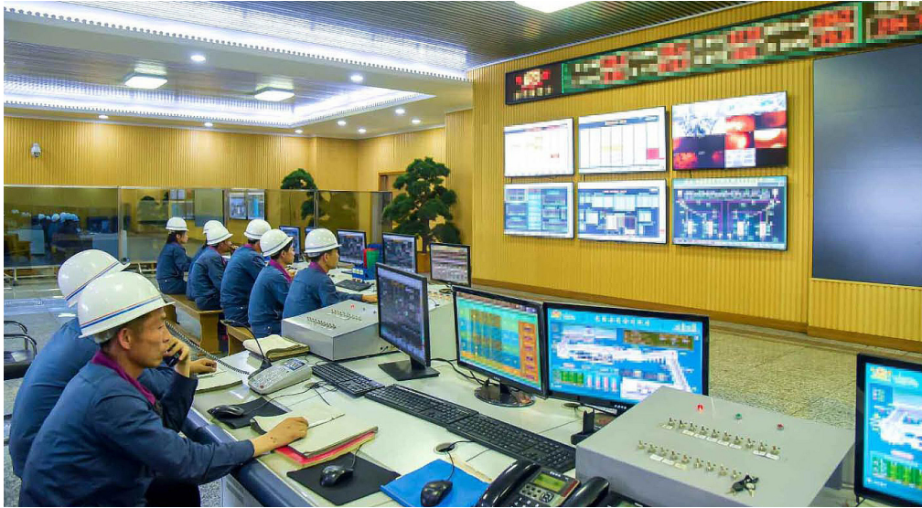
Economic arrangements and production control are done scrupulously to increase power output at the Pukchang Thermal Power Complex.

Thermal power complex lays foundation for producing hundreds of millions of kWh of more electricity every year