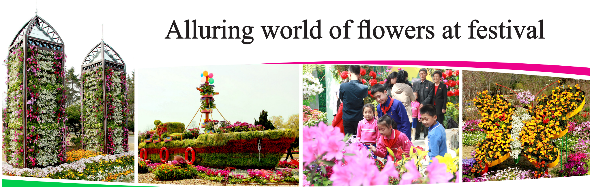
The Flower Festival-2025 is held at the April 15 Children's Flower Garden in Pyongyang between April 13 and 28.