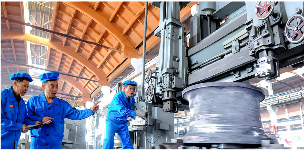
The production of machinery and equipment is stepped up at the Ranam Coal-mining Machine Factory.

Machine Factory conducted a brisk socialist emulation drive among workshops, machines and shifts, and increased the output by 1.5 times as compared with the same period of last year. The Pyongyang Kim Jong Suk Textile Mill has organized an exhibition of achievements in technical innovation on the theme of increased production and economization and science and technology to share valuable inventions and technical innovation plans.