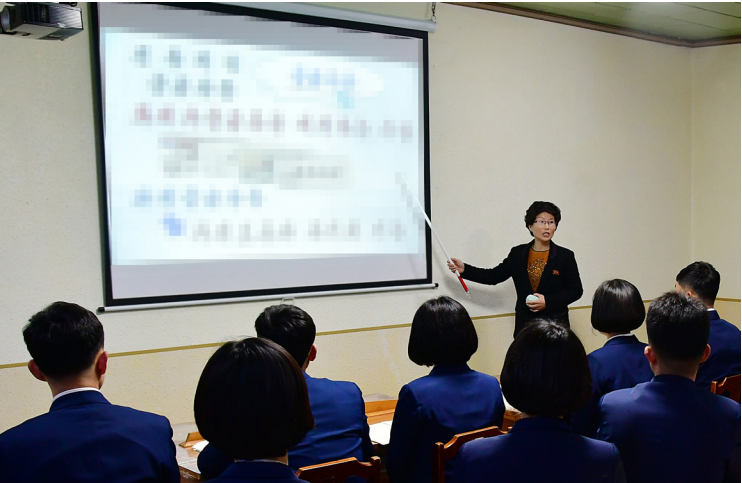
Wonsan Jong Jun Thack University of Economics introduces a new educational management system.