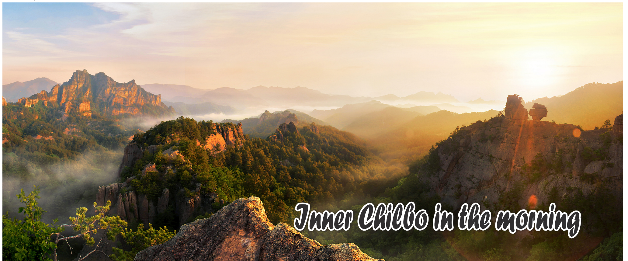
Inner Chilbo in the morning