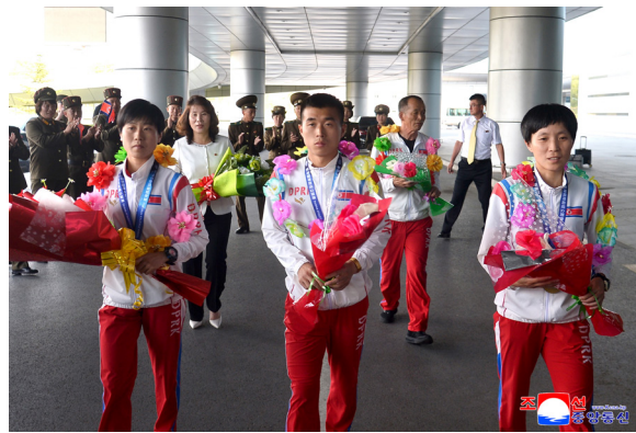
DPRK players return home on June 10 after taking part in the Chinese Taipei Athletics Open 2025.