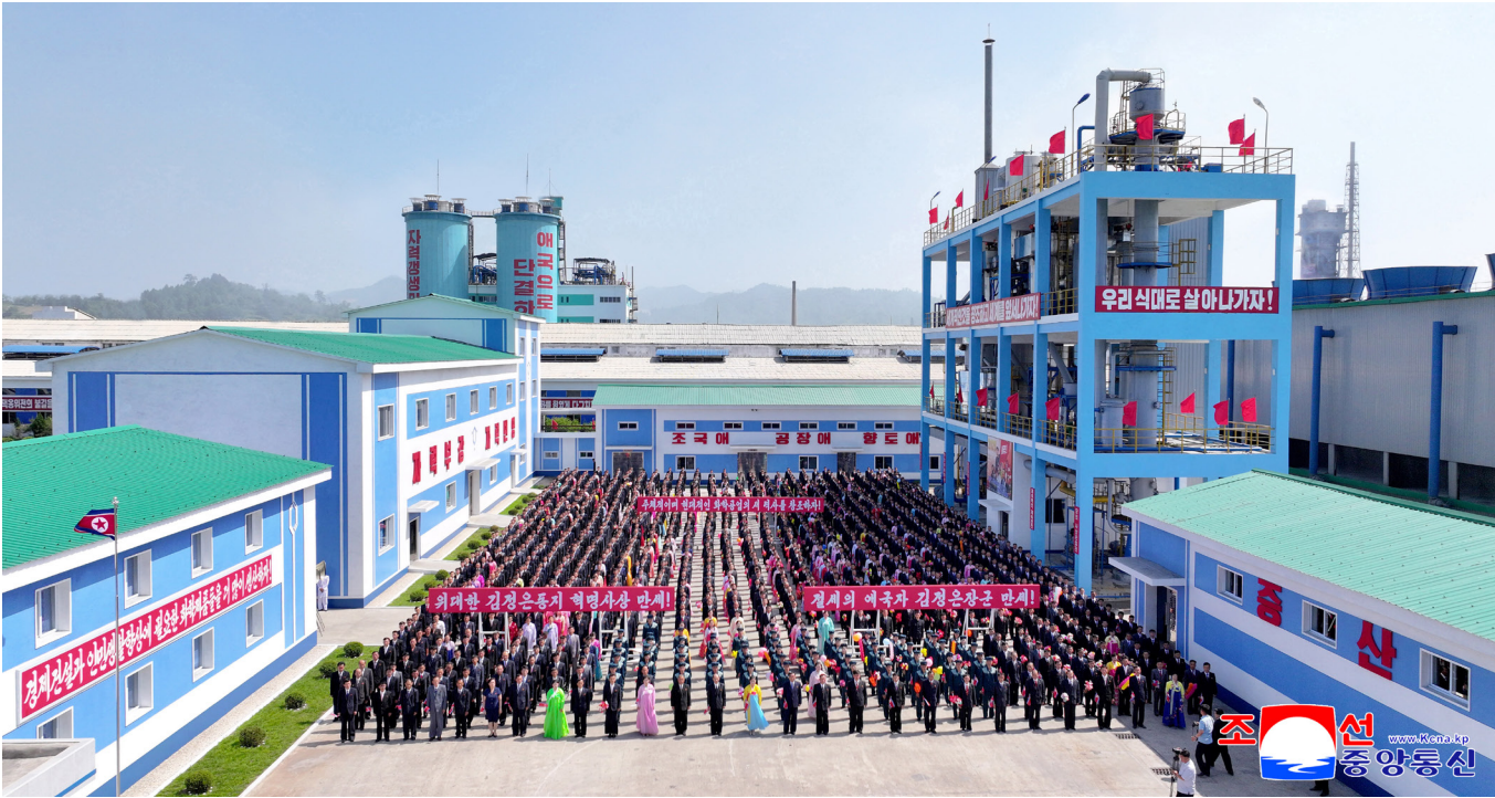
An inauguration ceremony of the melamine resin production line is held on the spot at the Hungnam Fertilizer Complex on June 9.

That day an art performance was given in congratulation of the inauguration.