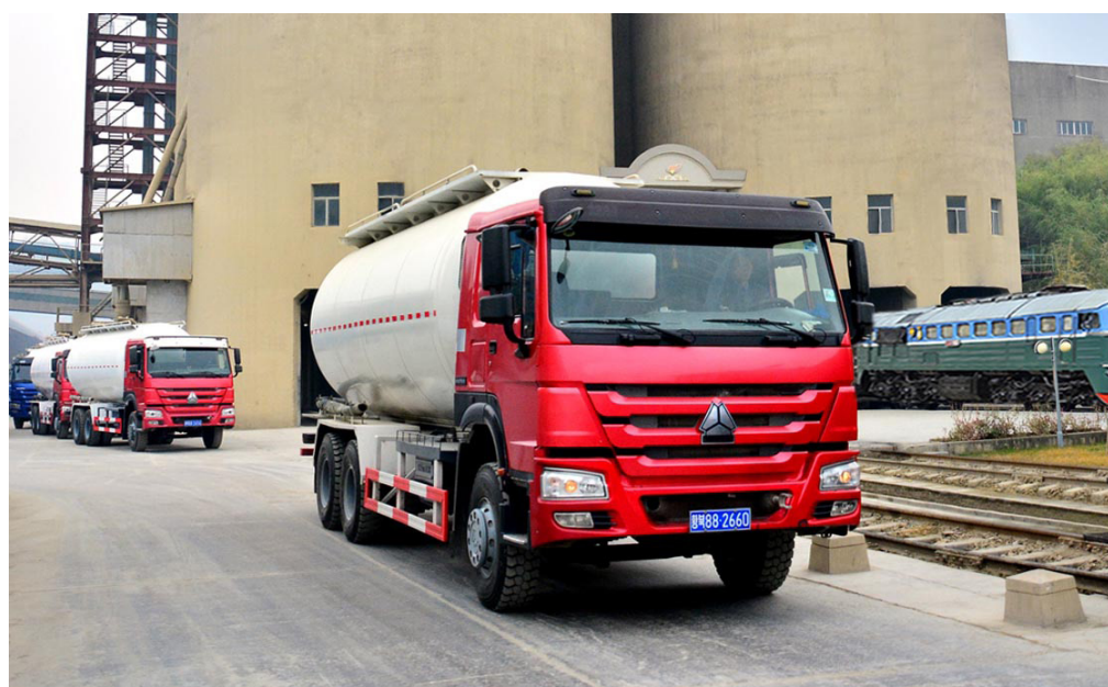
Workers make miraculous achievements in cement production at the Sangwon Cement Complex.