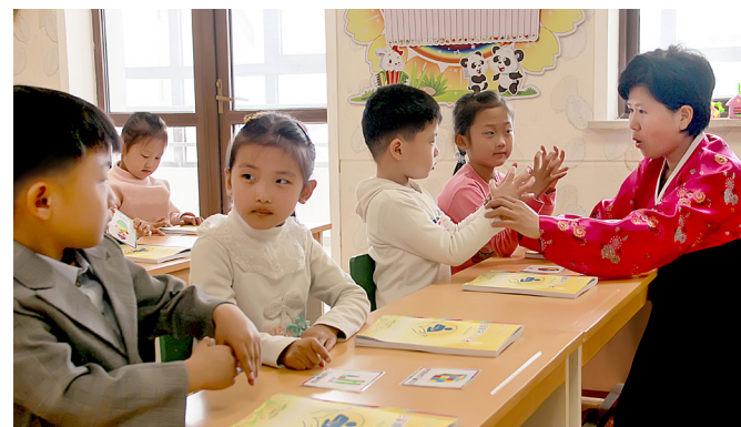
Children with disabilities are taught sign language.

The disabled children are living in the weekly kindergarten class where all conditions for their life are fully provided and a commuter bus carries them to and from their homes along with their parents.