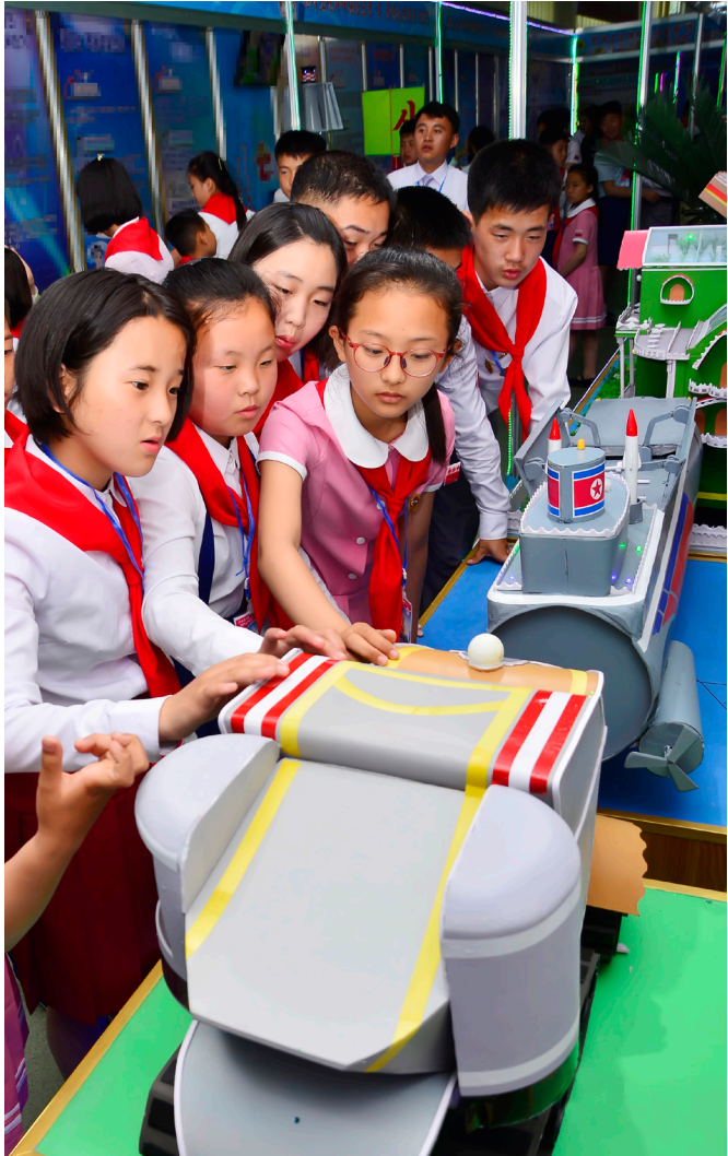
The exhibition is held at the Sci-Tech Complex in Pyongyang from June 2 to 7.