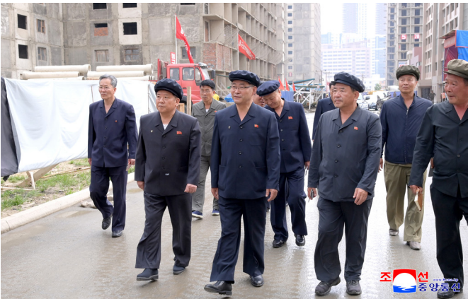
Premier Pak Thae Song (centre) inspects the construction site of 10 000 flats at the fourth stage in the Hwasong area, Pyongyang.