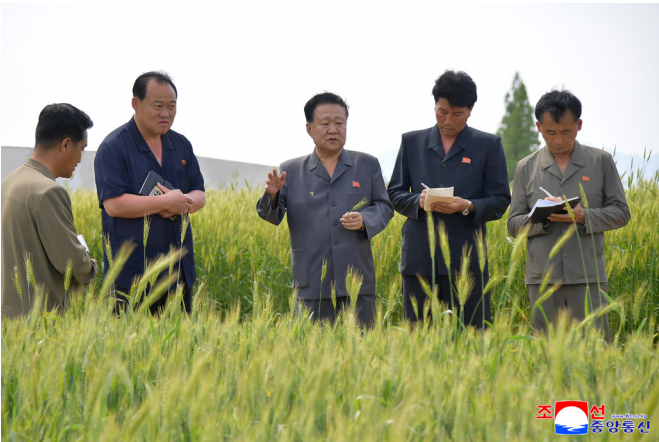
Choe Ryong Hae, chairman of the Standing Committee of the Supreme People's Assembly, (third from left) learns about agricultural affairs in the Taephung Farm in Chongdan County.

At the Sinwon Cement Factory and the wharf construction site of the Kumpho Mine of the Hwanghae Iron and Steel Complex, he stressed the need to put efforts into the management of equipment